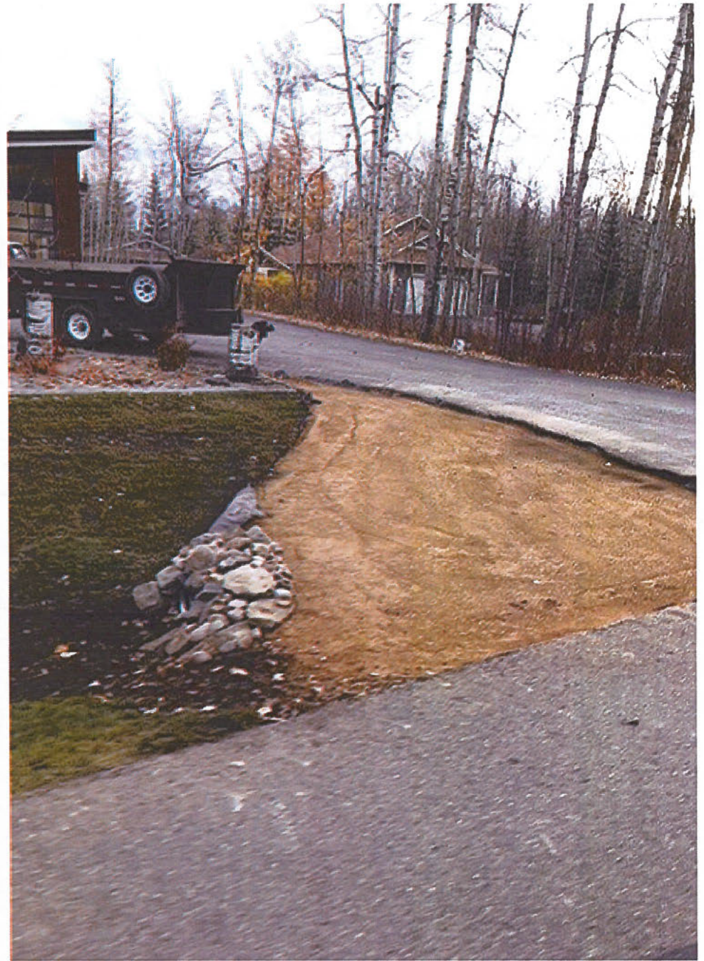
To be paved to blend original.