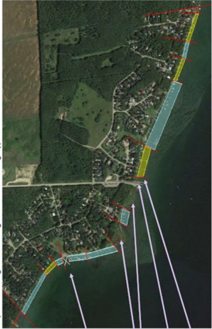
Figure 1 – shows EOS segmentation for municipal mooring plan